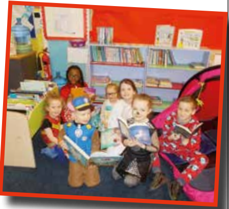
Enjoying World Book Day

World Book Day is a celebration! It's a celebration of authors, illustrators, books and it's a celebration of reading. This is the 21st year there's been a World Book Day, and on 1st March 2018, children of all ages came together to appreciate reading.